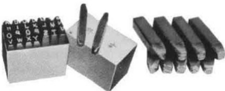
Figure Punch Set 0-9 Size 8MM 9 Pcs

9-piece digit punch set (0–9) with 8 mm character height for bold, permanent number stamping on steel and other metals. Suited for marking hull plates, machinery housings, and deck fittings.